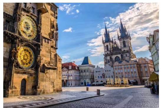
Old Town Square