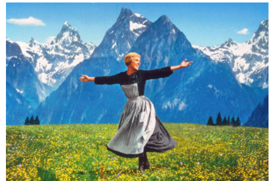
Sound of Music