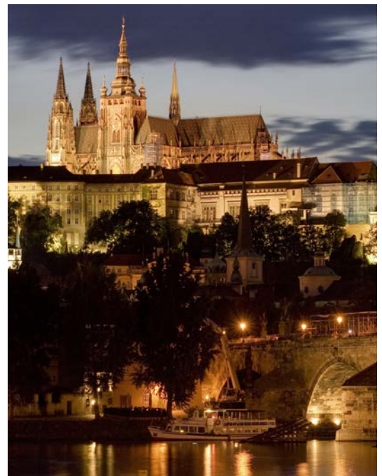
St Vitus Cathedral & Prague Castle