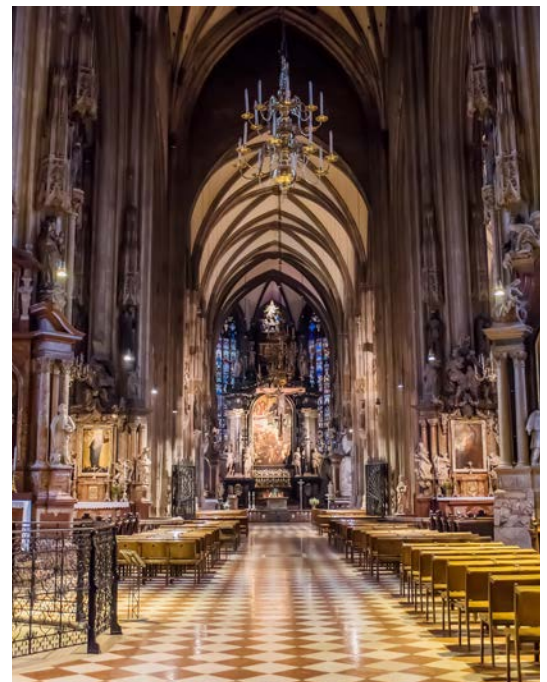
St. Stephen's Cathedral