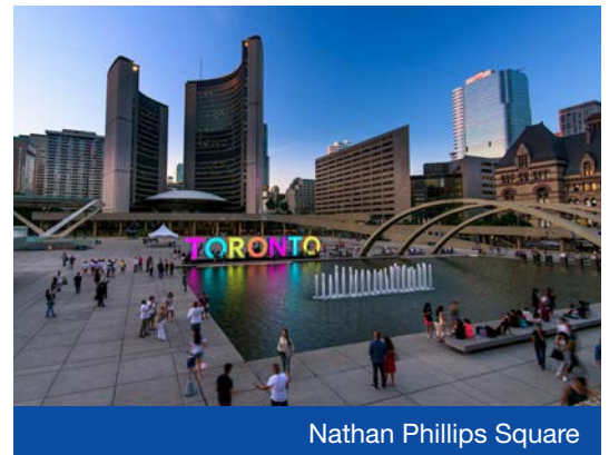
Nathan Phillips Square