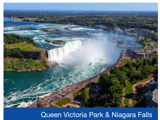
Queen Victoria Park & Niagara Falls