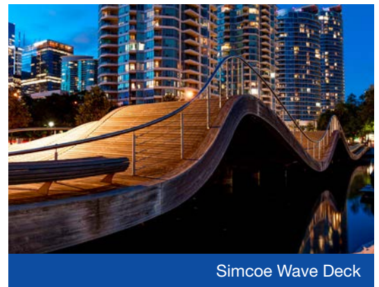
Simcoe Wave Deck