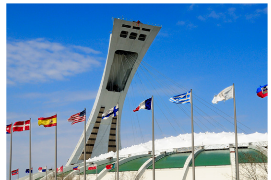
Montreal Stadium & Observatory