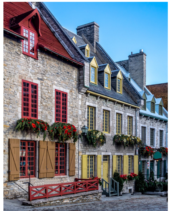
Place Royale, Quebec City