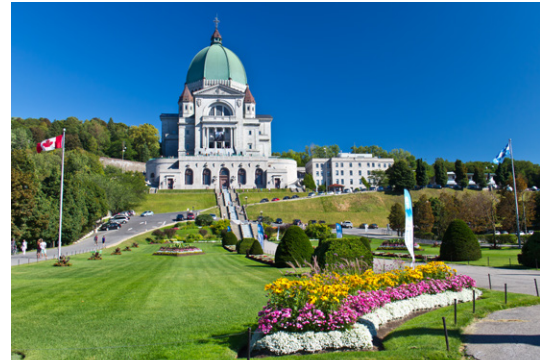
Saint Joseph's Oratory, Mount Royal