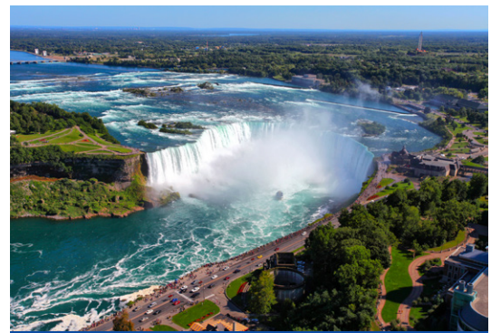
Queen Victoria Park & Niagara Falls

Confirmation of performances is dependent upon early receipt of performance information: biographies, pictures, recordings and repertoire