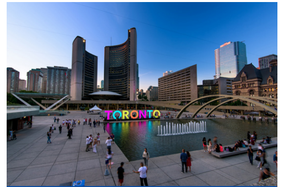
Nathan Phillips Square

This morning you board the bus to tour the Historic District and St. Lawrence Market which was built in the 17th century and today houses stalls selling goods from gourmet cured meats on to handcrafted jewelry and everything in between. Continuing on, you will take a guided tour of the historic Legislative Assembly of Ontario nestled in Queen's Park. We will then head to the waterfront area with time for lunch prior to exploring the Toronto Music Garden, Canoe Landing, Simcoe Wave Deck, the Harbourfront Centre and the Sherbourne Common. There is time to prepare for your second tour CONCERT . Overnight Toronto