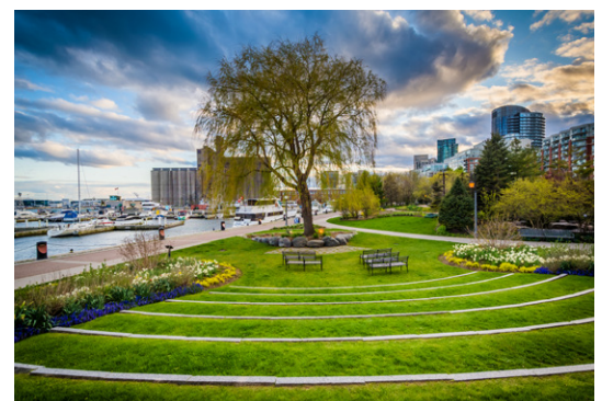
Toronto Music Garden