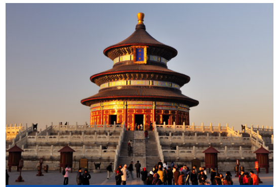
Temple of Heaven

Confirmation of performances is dependent upon early receipt of performance information: biographies, pictures, recordings and repertoire