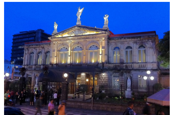
National Theatre of Costa Rica

After sampling the hot and cold breakfast buffet (offered daily), we board our bus for a visit to Irazu Volcano National Park. The Irazu Volcano, still active, last made international headlines when it erupted in 1963 on the day that former US President John F. Kennedy visited the country. The eruption decimated crops in the area but left the soil enriched for decades to come. The last noticeable activity came in 1996, and since then Irazu has been a quiet giant. Reaching upward of 11,260 ft (3,432 m), Irazu is the tallest and most energetic volcano in Costa Rica. Its huge crater is surrounded by a moonscape and it has a small lagoon at the bottom. We return to stage the first of our Costa Rican CONCERTS . Overnight San Jose