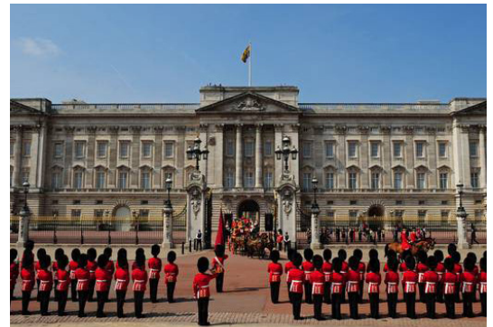
Changing of the Guard