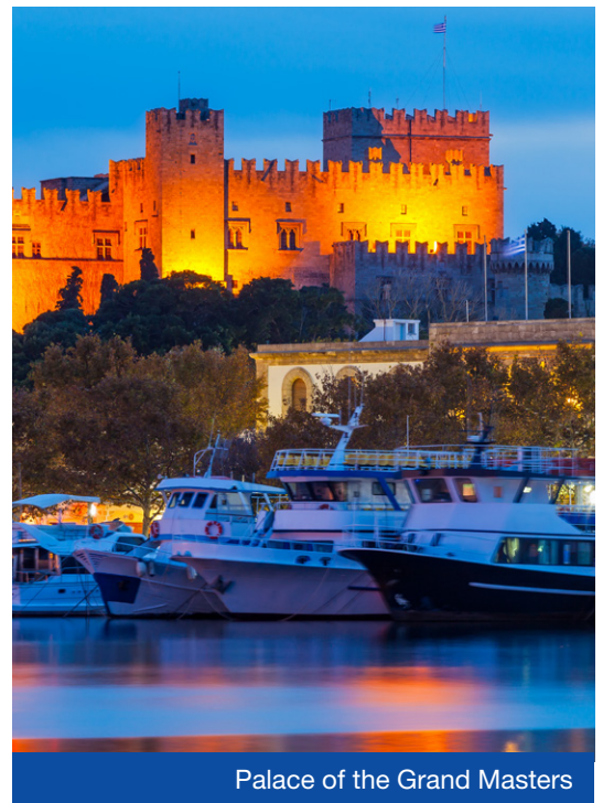
Palace of the Grand Masters

Glide into the beautiful harbor of Rhodes, which in ancient times was straddled by the famed Colossus. Reflecting Roman, Saracen, Turkish, Medieval, and Italian influences, this ancient city was captured by the Crusader Knights of the Order of St. John in 1307 and has barely changed since then. We travel back in time as we explore Rhodes' Old Town in a walking tour which includes a visit to the Grand Master's Palace. We return to the ship and re-board with a Possible on-board RECITAL for other passengers (tbd).