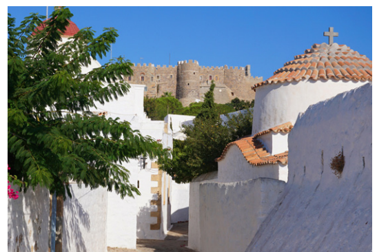
Monastery of St John