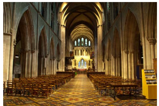
St. Patrick's Cathedral

Confirmation of performances is dependent upon early receipt of performance information: biographies, pictures, recordings and repertoire