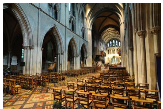
St. Patrick's Cathedral