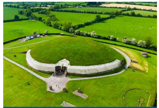
Brú na Bóinne