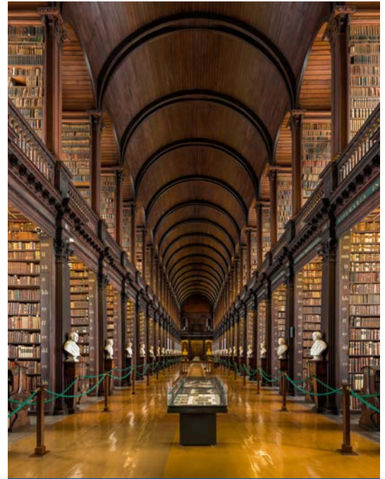
Library of Trinity College