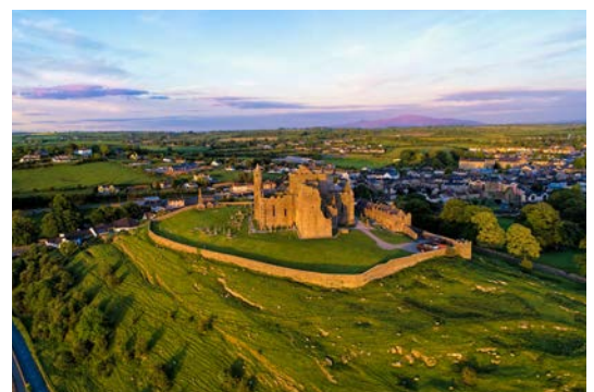
Rock of Cashel