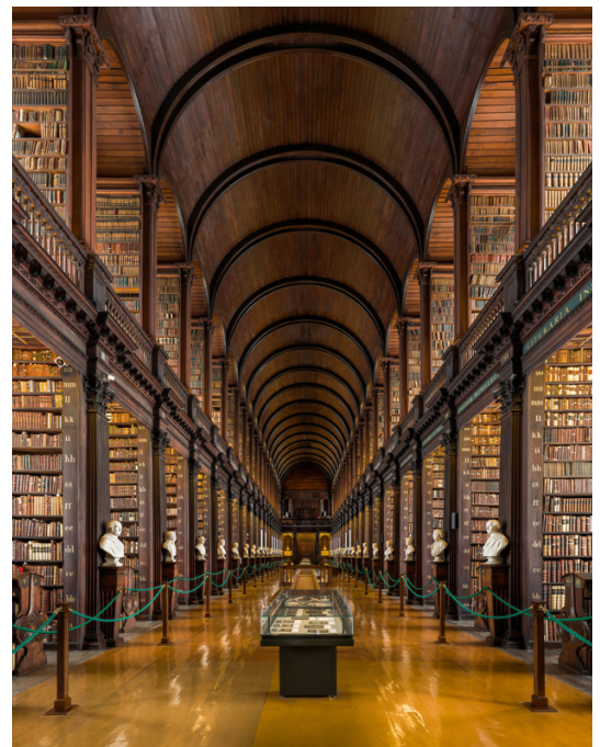
Library of Trinity College