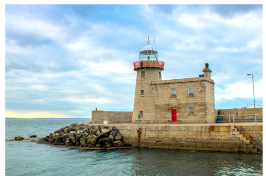
Howth Harbour Lighthouse