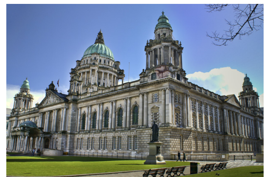
Belfast City Hall