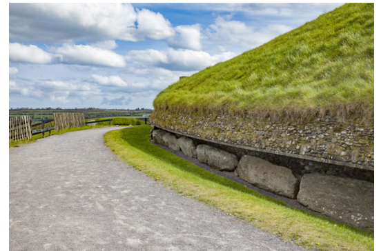
Brú na Bóinne

After sampling the hot and cold breakfast buffet (offered daily) you embark on a city tour of Belfast. There is so much to see including St. Anne's Cathedral and Belfast City Hall along with the fine Victorian and Edwardian architecture everywhere you look. Learn about the recent 'troubles' of Northern Ireland's past from people who lived through them. After time for lunch you tour the interactive Titanic Experience to relive the entire story from the ship's construction, its maiden journey, tragic sinking then discovery on the seabed. Overnight Belfast