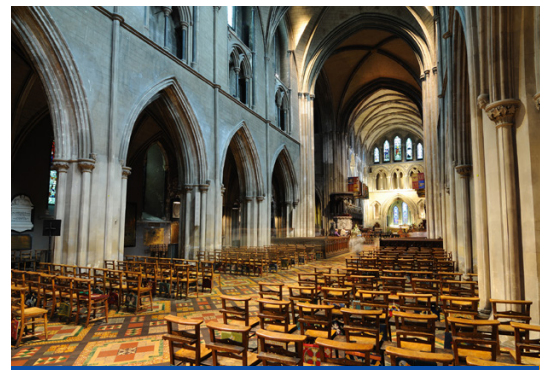
St. Patrick's Cathedral

Transfer to airport and travel back home or extend tour