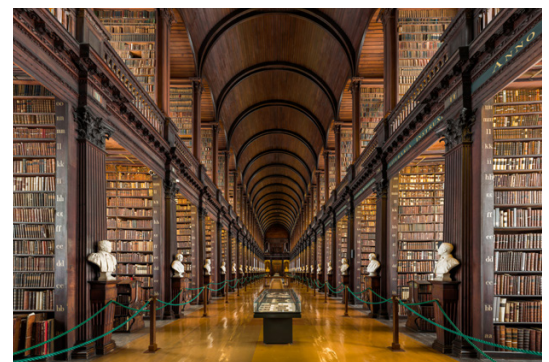
Library of Trinity College