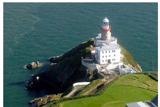
Baily Lighthouse, Howth