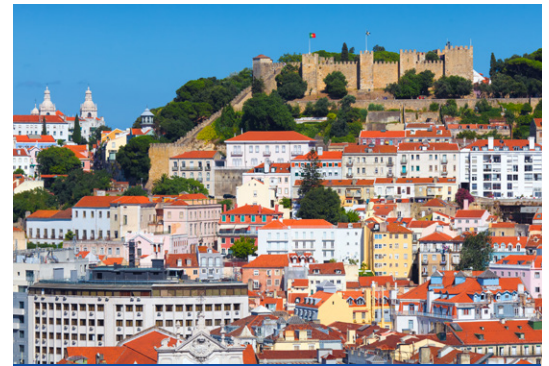
St. George Castle

This morning you will board the tour bus to nearby Sintra, named a UNESCO World Heritage Site because of its many 19th-century Romantic architectural monuments. After your visit to Sintra we will return to Lisbon and you will have time to explore this fascinating city prior to dinner. Dinner will include a Fado performance, so you can experience the folk music of Portugal which is known for being filled with emotion and nostalgia. Overnight Lisbon