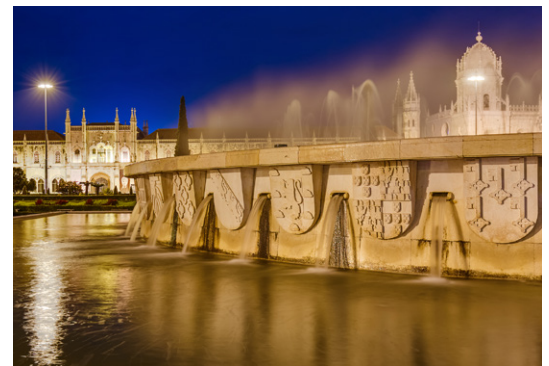
San Jeronimo Monastery