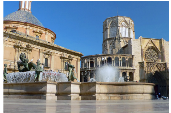
Cathedral of Valencia