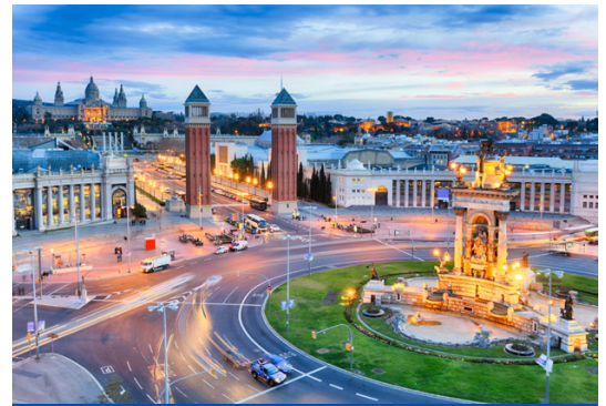
Plaza de Espana, Barcelona

Visit Gaudi's Park Güell, futuristic in its design with commanding views over the city. Explore the Gothic Quarter of Barcelona with time to promenade on La Rambla with its bustling displays of street theatre, performance and street markets. After preparing for tonight's performance we stage the first of your tour CONCERTS . Overnight Barcelona