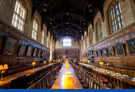
Christ Church College Great Hall