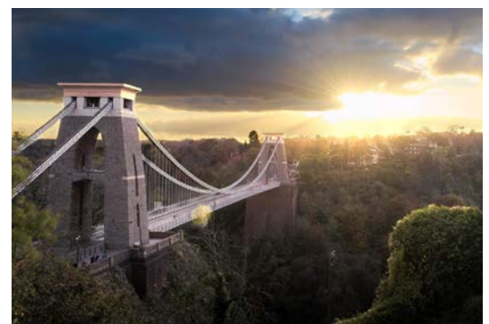
Clifton Suspension Bridge, Bristol